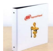
Varius documentation requirements.