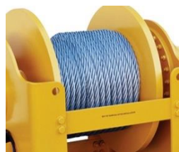
Various length and types of wire ropes.