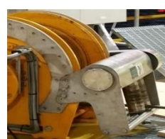
Spooling device (available as geared and auto-air)